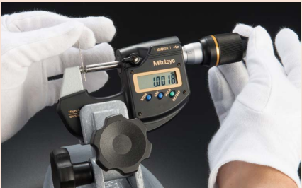
Recommended micrometer stand: 156-101-10